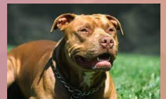
Pit Bull Terrier

If you consider a dog is a serious risk to a child, you should contact the Police immediately