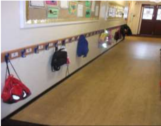
This is where I hang my coat and bag