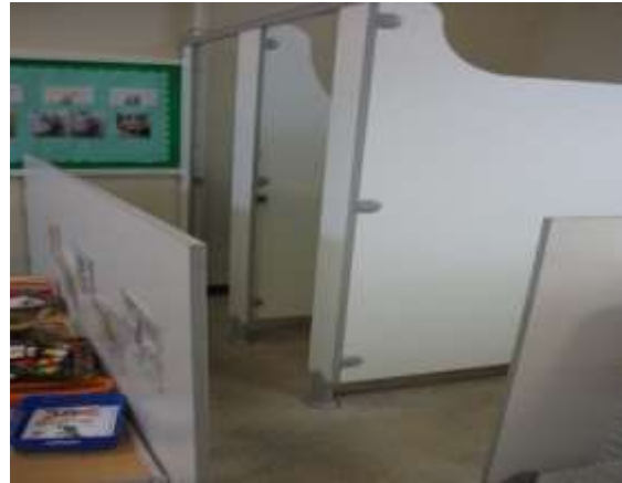
There are toilets in my classroom

There are lots of play areas in my new classroom like playdough, sand, water, reading area, painting and an outdoor play area.