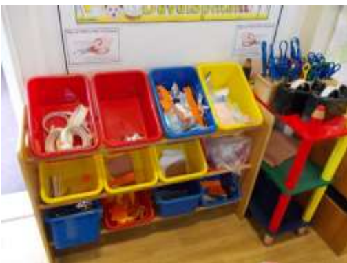
Cut and stick area