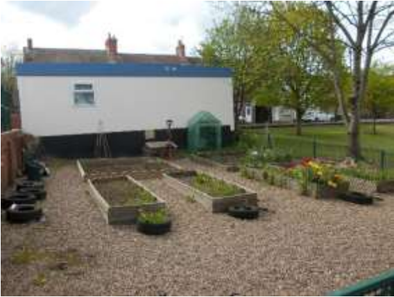
School gardening area