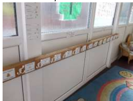
Cloak room for coats and bags