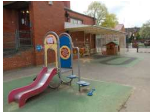
Nursery outdoor play area